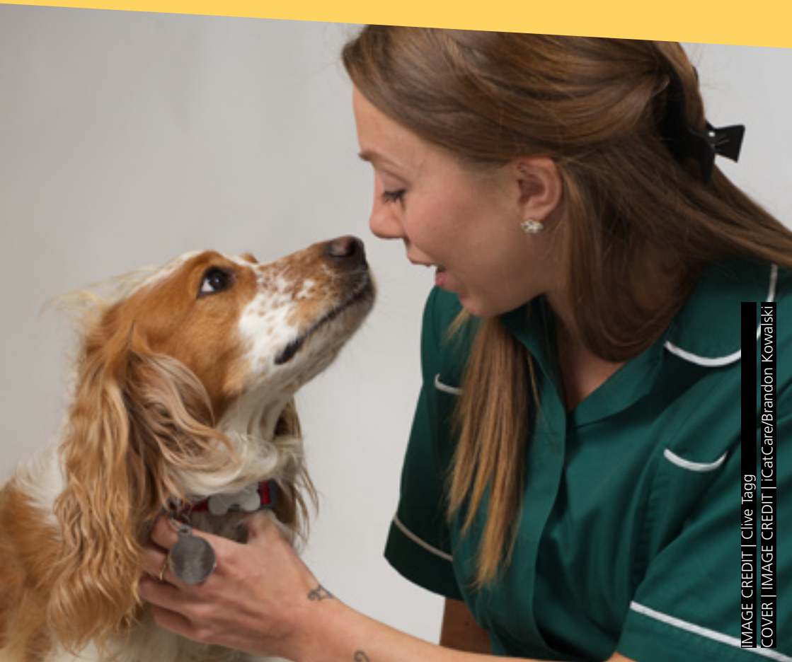
COVER

Website | www.dogandcatwelfare.eu Email | info@dogandcatwelfare.eu Phone | +44 7920 658685 Twitter | @EUdogsandcats Facebook | @EUdogsandcats